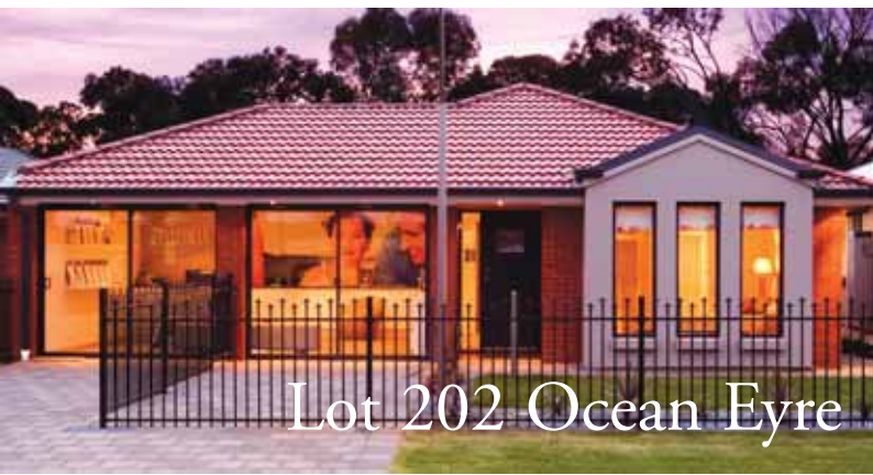
Lot 202 Ocean Eyre